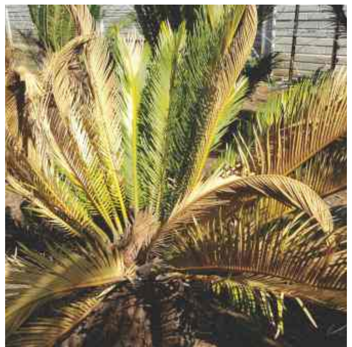
Signs of heavily infected cycad