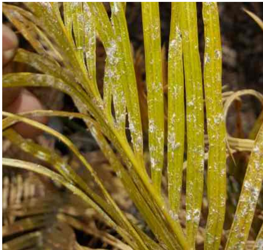
Signs of extreme infected cycad