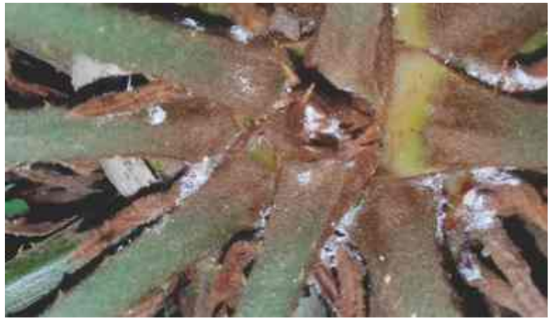
Infected crown, scale moving into crown