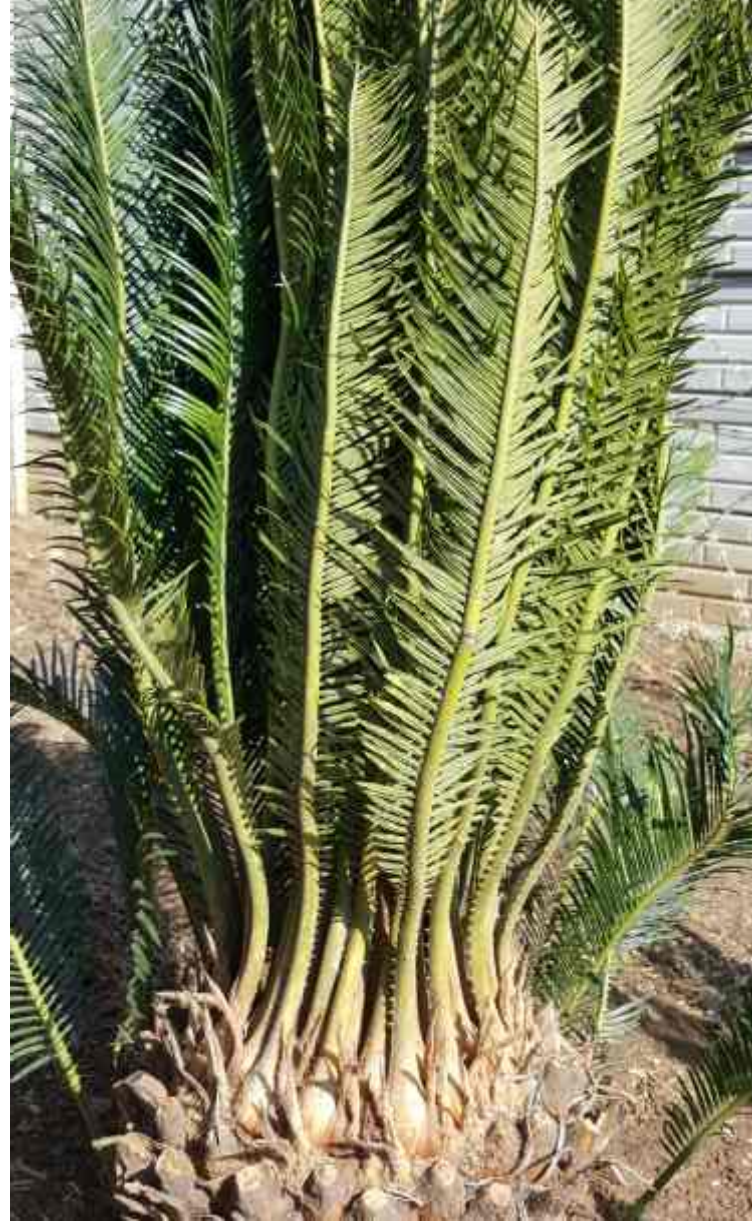
Signs of stress, infected cycad