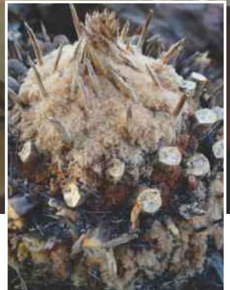
Cycad under no stress. Check out the wool and colour!