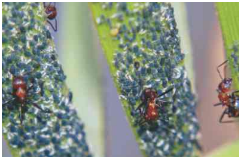
Ants also helps control scale insects. One of the biggest biological warfare enemies of the scale insect.

No evidence yet that it is attacking Encephalartos cycad species native to South Africa! Very active on all cycad species, like C. Revoluta, C. Thouarsii and Dione species.