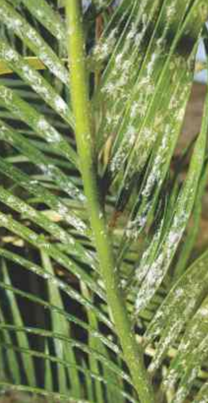
Heavily infected cycad. Check the back of the pinna.