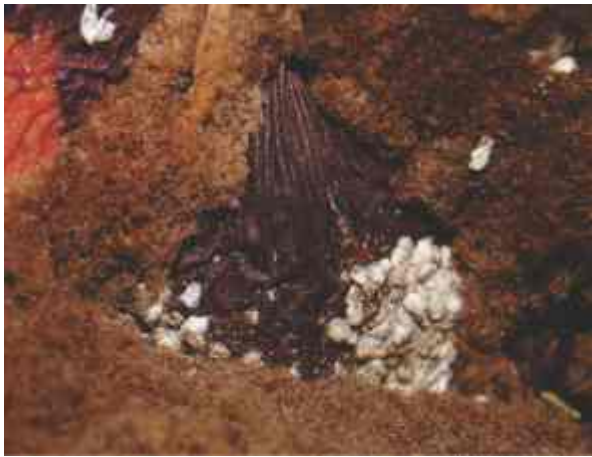
CAS moving into the stem, scale