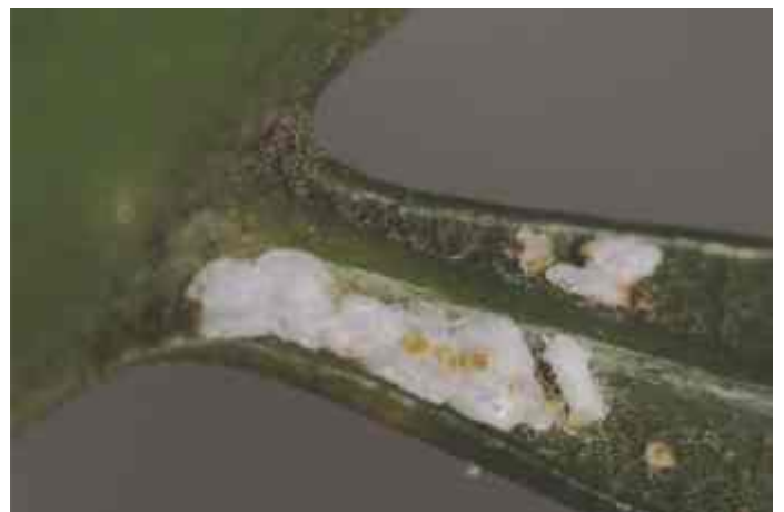
All the signs!