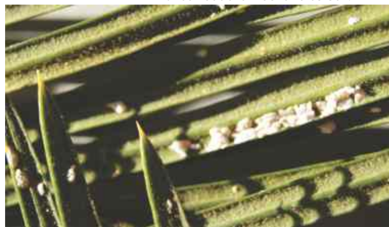
Infested scale on bottom of pinnas