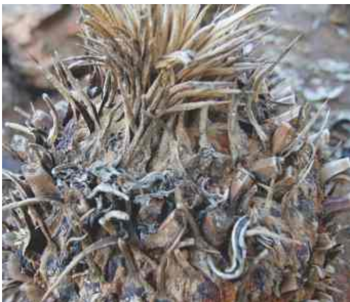
Cycad under stress, check out the colour of the stem!