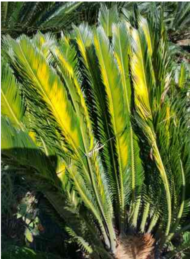
Signs of sunburn, heat wave!