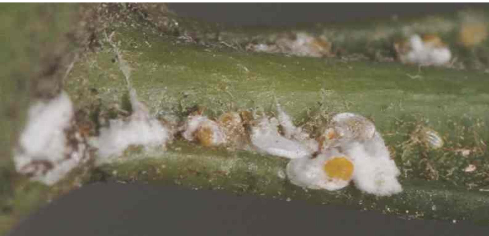
Pic blown up for your convenience!