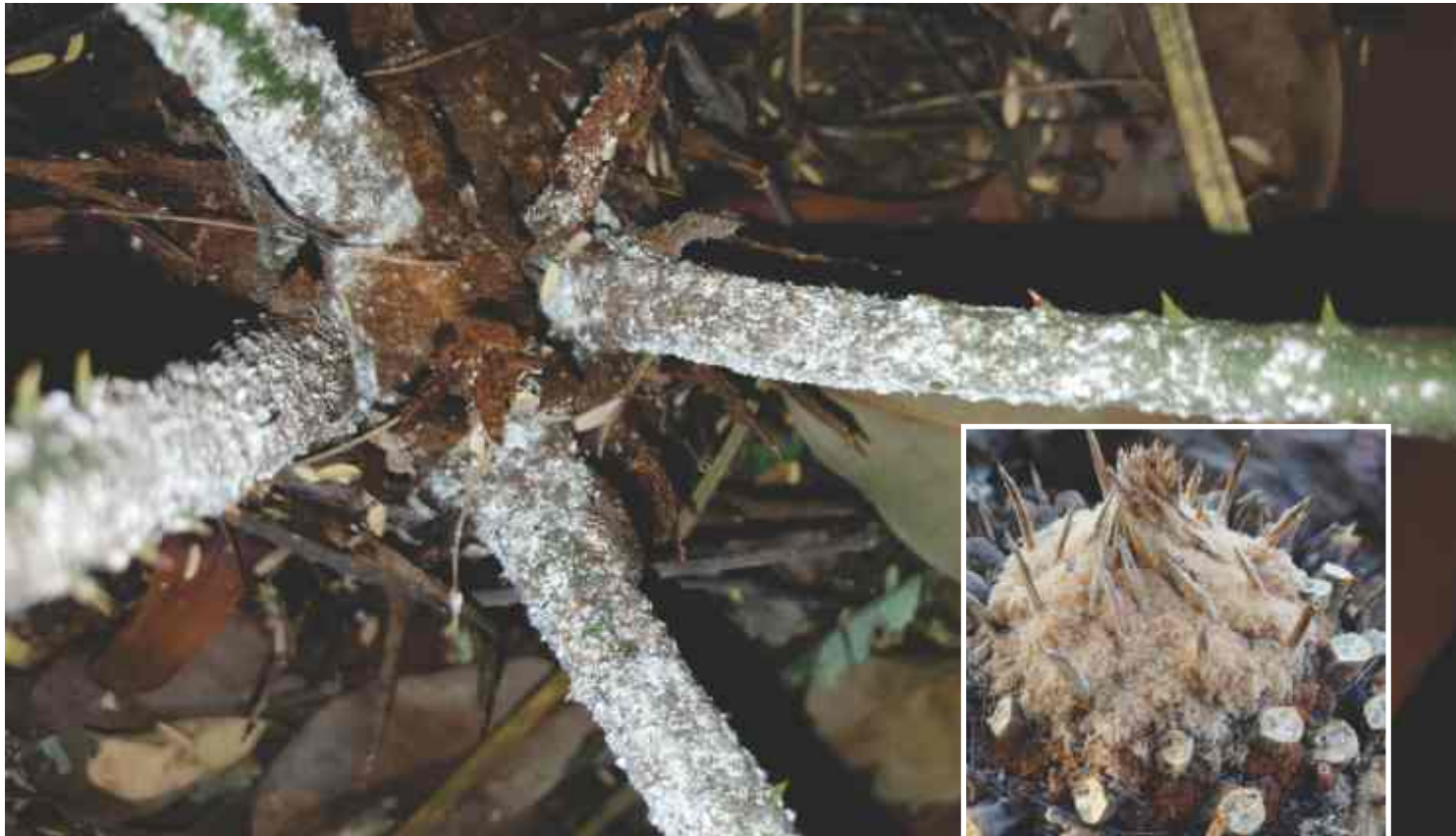
Heavily infected cycad