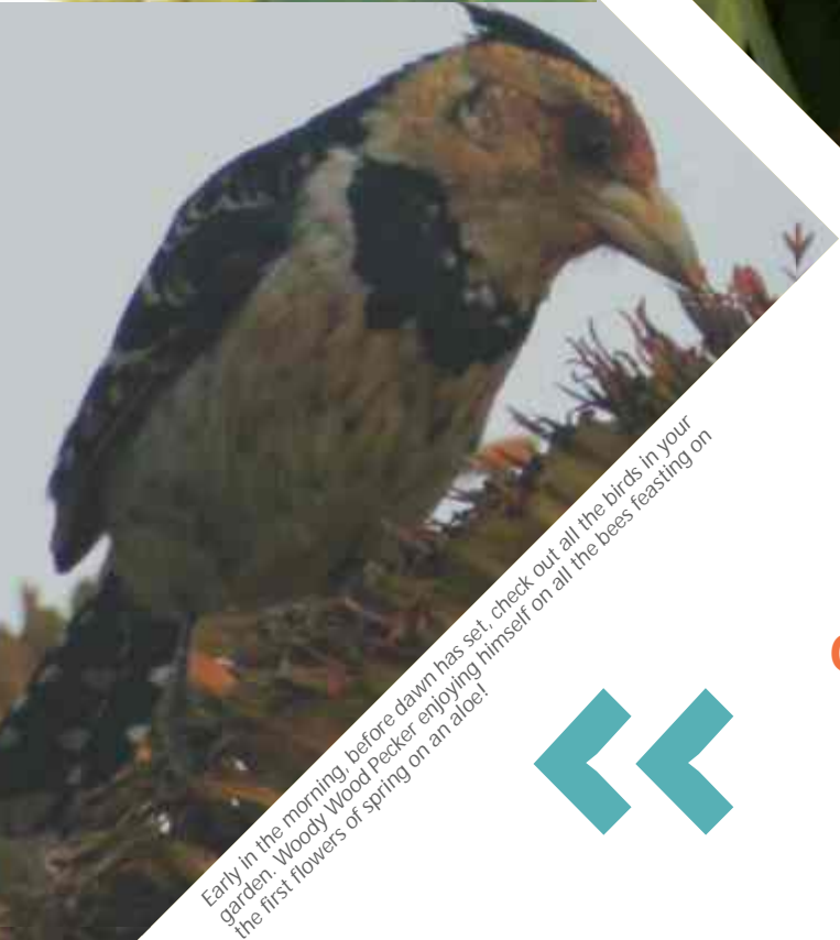
Early in the morning, before dawn has set, check out all the birds in your garden. Woody Wood Pecker enjoying himself on all the bees feasting on the first flowers of spring on an aloe!