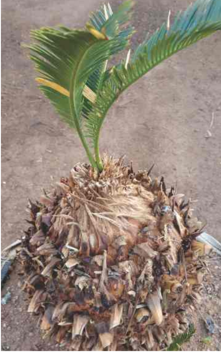
Signs of stress