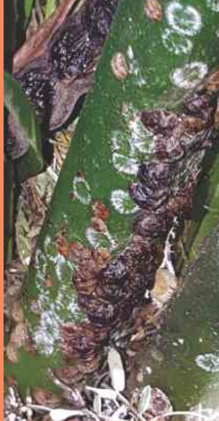
Cas, all dead after treatment. Check page 7 for the treatment and insecticides that works for us.